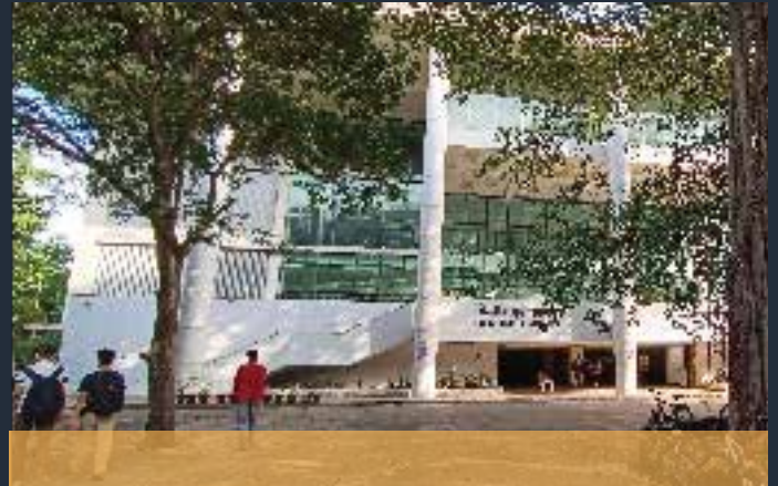
New Library Building