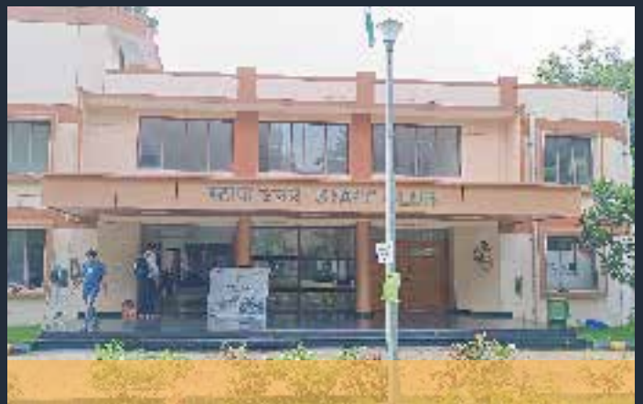
Renovation of Staff Club