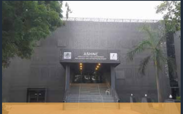
ASHINE Building (Old Library Building Redeveloped)