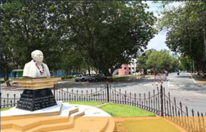
Campus Road Development