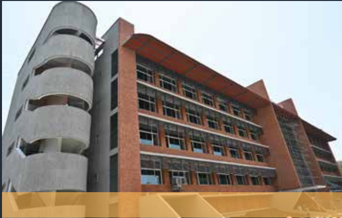
Admin Building Development (HEFA Loan Project Cost: Approx 250 Cr.)