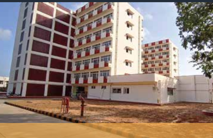
New Boys Hostel Building Atal Bihari Bajpayee Bhavan